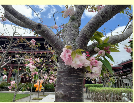
Cherry Blossoms in the Courtyard