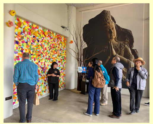
Art Salon Exhibitions and Guided Tour