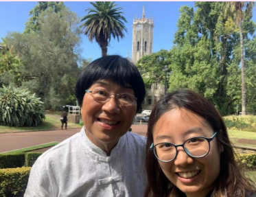
In Albert Park