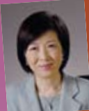
Mrs LAW FAN Chiu-fun Fanny, GBS, JP 羅范椒芬女士

BSc 1972, BSc (Special) 1973 Director, Laboratory for Atmospheres, NASA, Goddard Space Flight Center Senior Science Advisor for the Hong Kong Observatory Adjunct Professor, Department of Mathematics, The Hong Kong University of Science and Technology Adjunct Professor, Department of Atmospheric and Oceanic Sciences, University of Maryland, USA Goddard Senior Fellow of the American Meteorological Society Fellow of the American Geophysical Union Recipient of American Meteorological Society Meisinger Award Recipient of NASA John Lindsay Award Recipient of Goddard Exceptional Science Achievement Medal Recipient of William Nordberg Award in Earth Science