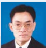
Tam Wing-pong 譚榮邦 (BSocSc 1971)

Permanent Secretary for Constitutional Affairs