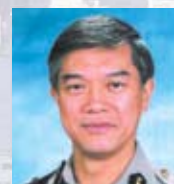
Kwok Leung-ming 郭亮明 (MSocSc 1998)

Commissioner for Economic & Trade Affairs, USA