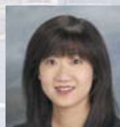
Margaret Fong 方舜文 (BA 1985)

Commissioner for Economic & Trade Affairs, USA