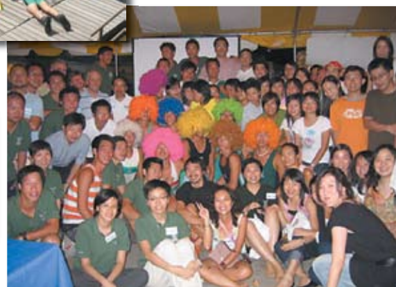
Celebration Party of the 20th Anniversary of IRC on September 17, 2006