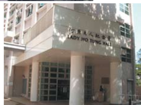
Lady Ho Tung Hall 1951-1997 (above) and Lady Ho Tung Hall since 2001 (below).