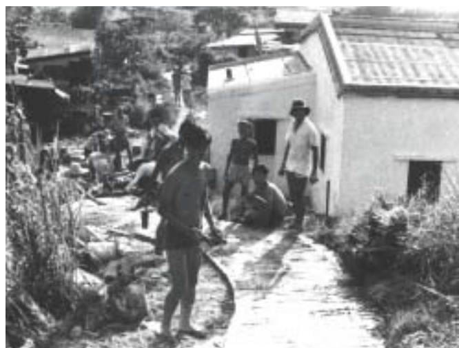
Helping to repair a village road in 1966 (at right, with hat).