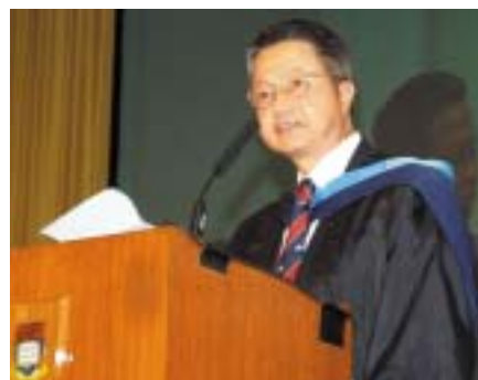
The miracle man returns: sharing his experiences with new students at the 2004 Welcoming Ceremony.

After graduation, I was a schoolteacher for a while, and as of the early 1970s, a financial analyst – or to be exact, a securities analyst – for over a quarter of a century until I retired a