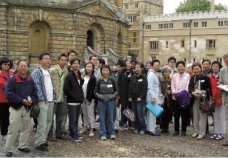
At Oxford University