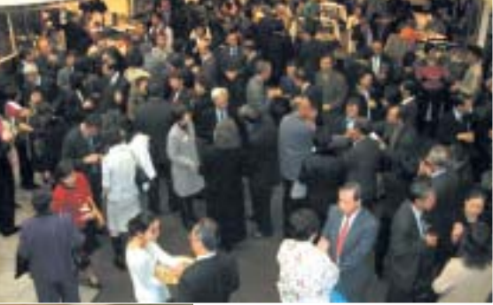
Vancouver Alumni Dinner attended by alumni, students, staff and friends

Government officials. businessmen, academics and community leaders at the luncheon talk