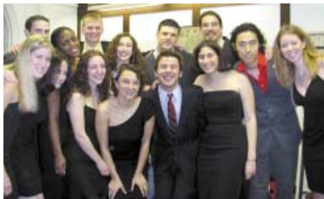
Getting into the swing

important of these opportunities was being able to audit the PhD programme”.