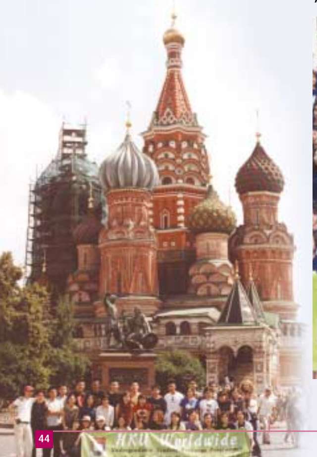
700 Students set off for global exchange