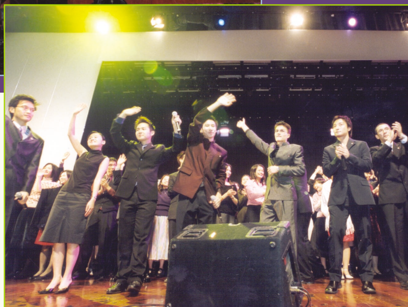
The students lead the Finale, the “Handover Ceremony”.

We are here to take over the responsibilities... We will take from society and we will give back, to Hong Kong our home, and together establish the values that we are proud of. We dare to change. And we dare to lead... We will continue the commitment...we are HERE for HK.”