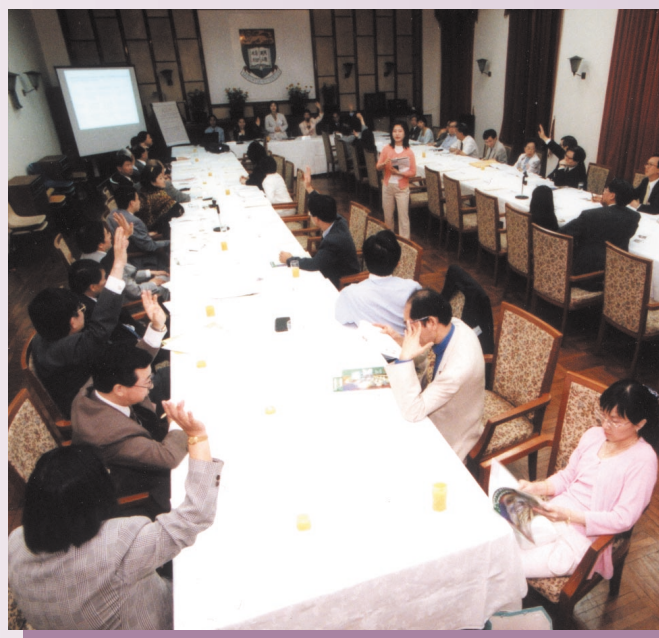
The annual Ordinary General Meeting & Election will be held on May 24, 2002 in Convocation Room, Main Building, HKU.

According to Clauses 29 and 31 of the Convocation Constitution, a person is eligible if he/she has been a member of Convocation for two years and a retiring member is eligible for re-election.