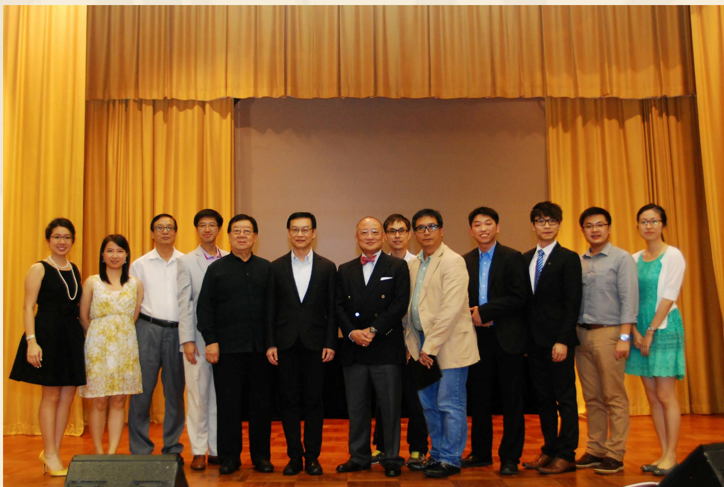
Executive Committee Session 2014-15