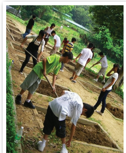
Incorporation of experiential learning into the curriculum is increasingly being formalised in programmes at HKU.