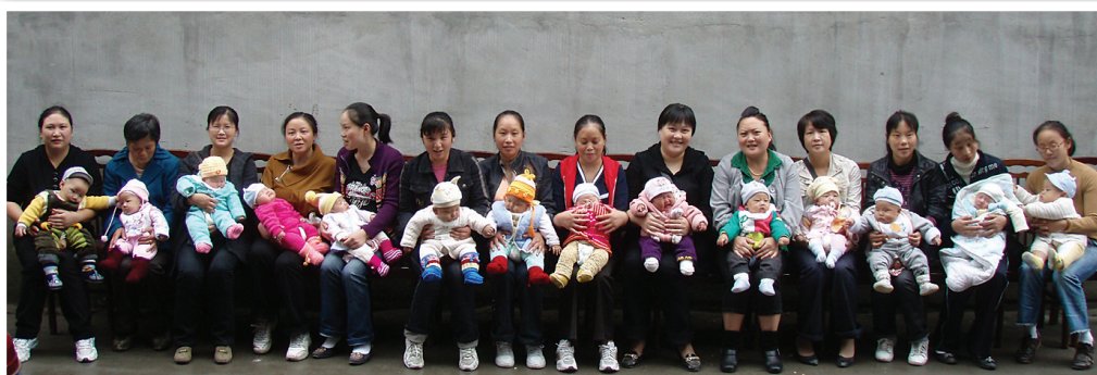
Centre on Behavioral Health supports mothers who lost their children in the 512 earthquake and whose newborn babies bring hope to Sichuan.