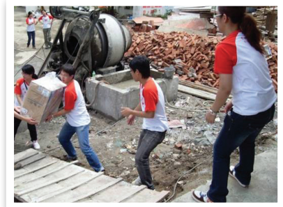
HKU students built a Solar-Powered Multimedia Satellite E-learning System for a reconstructed school in Deyang 德陽.