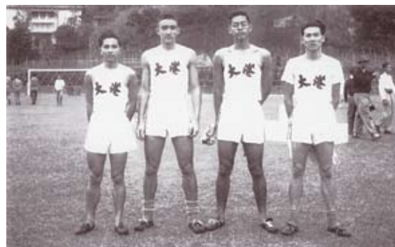
HKU Relay Team. Winner of the South China Athletics Association, Open Colony 4 x 110 yards Invitation Relay Race, 1949 Champions