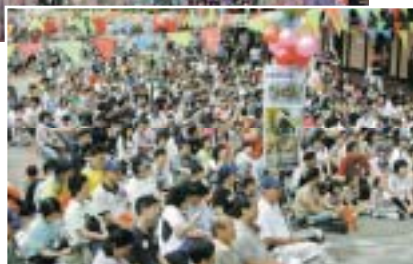
More than 1,800 students, parents and HKU alumni joining the HKUGA Primary School Walkathon on April 24.