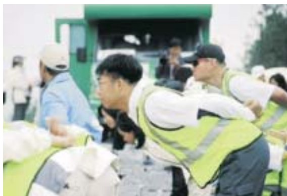
K K warming up.