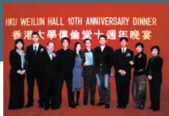
Wei Lun Hall: "We are the Dragons"

The event also triggered the formal establishment of Wei Lun Alumni Liaison (WLAL).